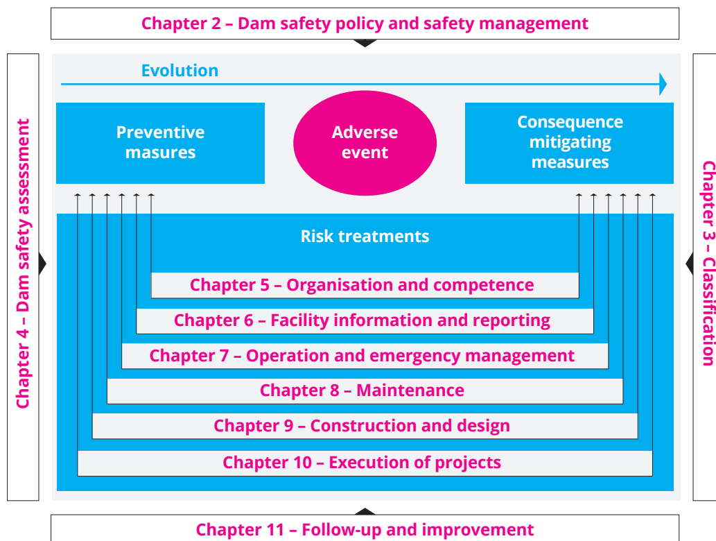
Figure 1. RIDAS structure with risk treatments for a dam facility in the inner box, as well as general conditions, classification, dam safety assessment and follow-up.

To support the application of RIDAS, a list of terms and their definitions has been created. 12